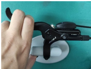
Not activated – Blue light

Step 4 – Repeat these steps for the sensor on the other brake lever & test it