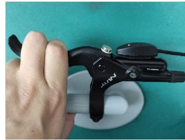
Activated – Red light

Please contact technical_support@cycmotor.com if further assistance is needed.